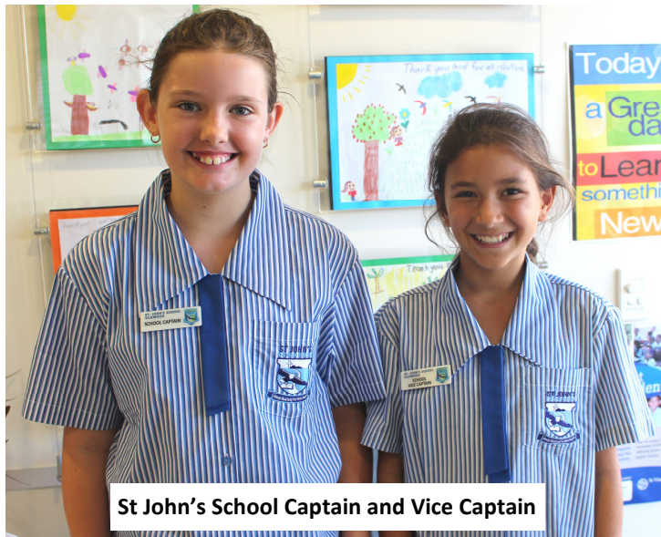
St John's School Captain and Vice Captain