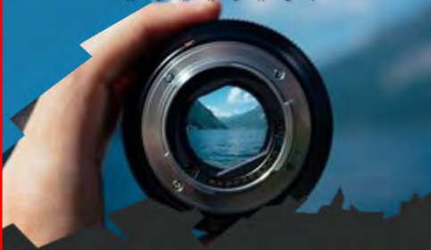
PHOTO GRAPHY WORKSHOP

COMMUNITY SUPPORT CENTRE INNISFAIL PRESENTS