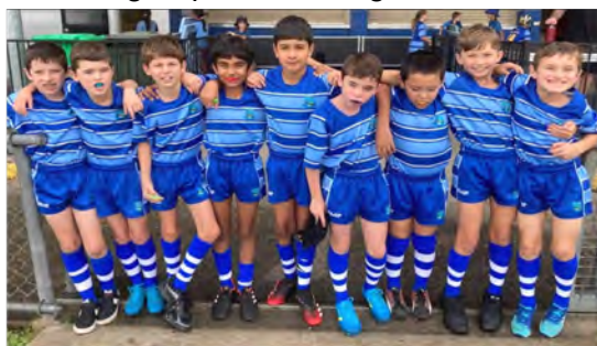
Ty Williams Cup