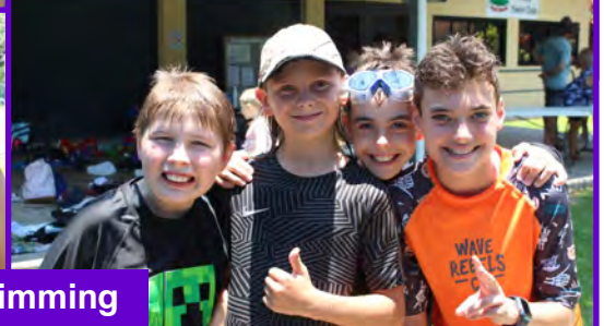
Interhouse Swimming Carnival