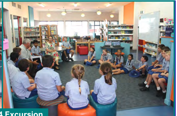
Year 3/4 Excursion